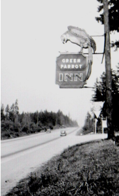
The Green Parrot Restaurant was located at South 340 th and Highway 99.

The directors of the newly consolidated school district 210 named the district “Federal Way” for the then new federal highway adjacent to the new school. The building was partially financed by the sale of school land for the right of way. The whole area became known as Federal Way and the city adopted this name when it was incorporated in 1990.