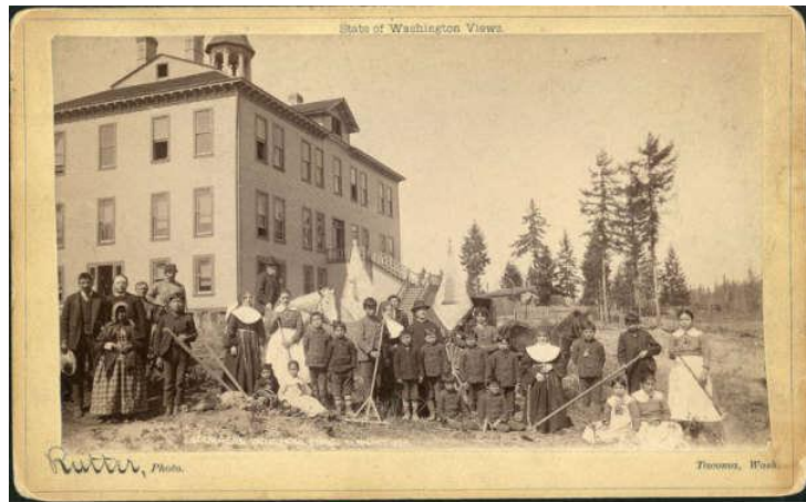
Figure 3 - Side View of the three-story St. George's School, probably around 1890. It appears that a work crew made up of students and staff is cleaning up the grounds. Father Hylebos is the second from left in the back.

The original entrance was located on the east side where Interstate 5 now adjoins the property. The road was known as the upper road thru Milton. 102