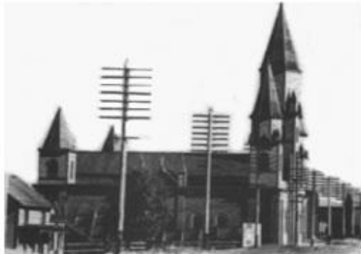
Figure 1 – The third St. Leo Catholic Church.