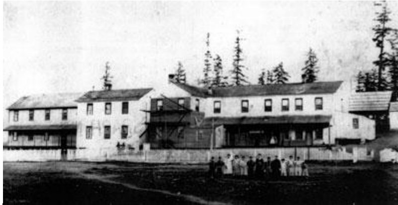
Figure 5 - This photograph is of the new 1935 construction. This photo is also used on the Puyallup Tribe web site but the actual building use or date is not described ( www.puyallup-tribe.com/index.php?nav=history&id=5 , accessed March 30, 2009.)

In 1935 the original 1888 unit was torn down and a dozen separate buildings including the chapel were connected together in one large 30 foot by 230 foot main structure consisting of two stories with three wings. Girls occupied the north wing, boys the south wing, and the chapel and sisters quarters were in the central wing. 139